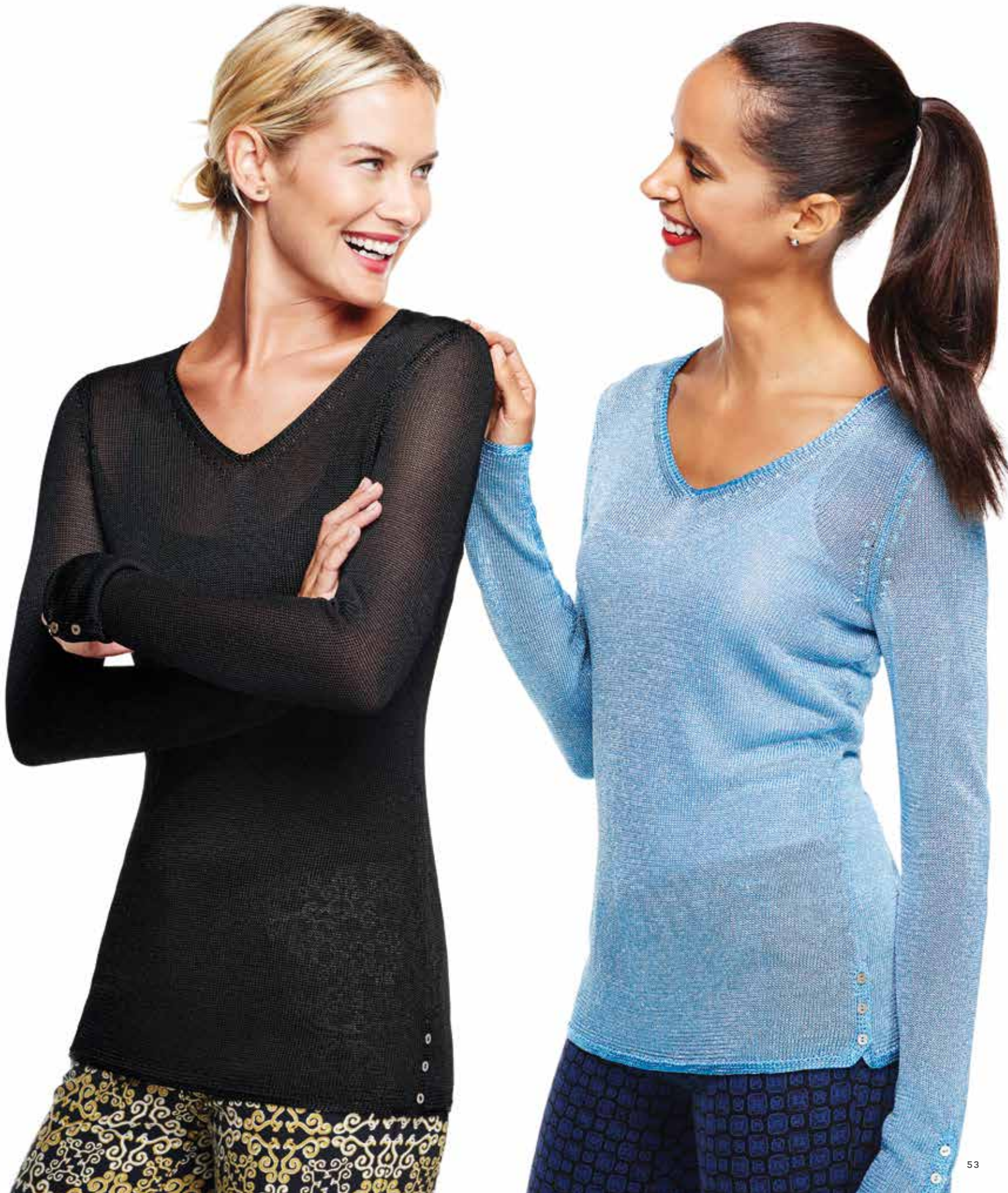
left page GLARUS POM POM HAT $58. FO12194102. Viscose blend jacquard with Rabbit fur pom pom. OS. Colors left to right (solid): Camel, red, blue, heather charcoal. ANNE SWEATER $188. FO119901022. Rayon metallic blend. Colors left to right (solid): gold, red, blue, black. XS-XL. Also featured on models black (left) and blue (right). right page, left model LEXI JEAN $178. FO120972469. Knit denim. Black/beige (newport scroll). Additional color in store and online. 0-14. right page, right model BECCA LEGGING $178. FO007122644. Bainbridge. Black/navy (malkata). Solid colors available in store and online. 0-14.