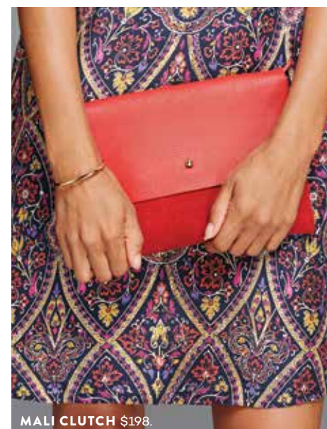
MALI CLUTCH $198.