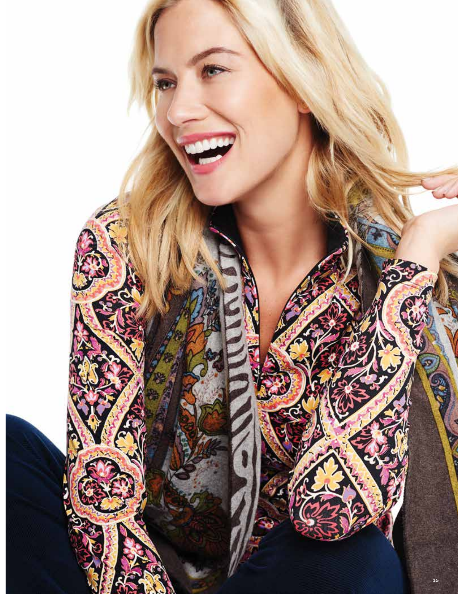
right page, JAIPUR SCARF $338. F0097312278. Cashmere. Reversible. Brown/gold/gray (roobios). Additional prints/colors in stores and online. OS. BEDFORD TOP $175. F0100432630. Catalina Cloth™. Black/gold (estate garden). Additional prints/colors in stores and online. XS-XL. FELICITY PANT $175. F0125761022. Stretch twill corduroy. Deep navy (solid). Additional colors in stores and online. 0-14.