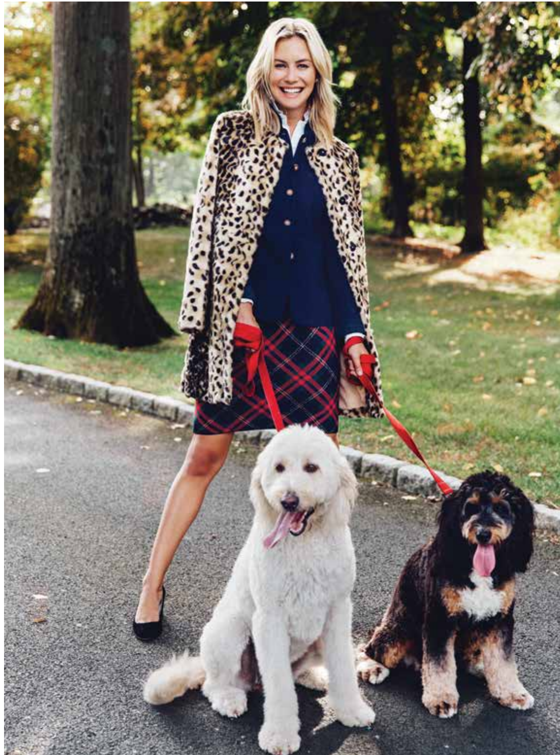
left page PELLA COAT $285. F0117861534. Faux fur. Beige/black (animal print). XS-XL. TYROLEAN JACKET $345. F0125341022. Polyester blend. Navy/dark green (solid). 0-14. FINDLAY BLOUSE $168. F0122511022. Stretch cotton nylon. White (solid). XS-XL. PARLOR SKIRT $168. F0117681057. Cotton modal. Black/green/red (tartan). XS-XL.