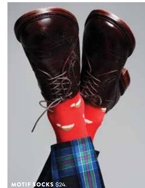
MOTIF SOCKS $24.