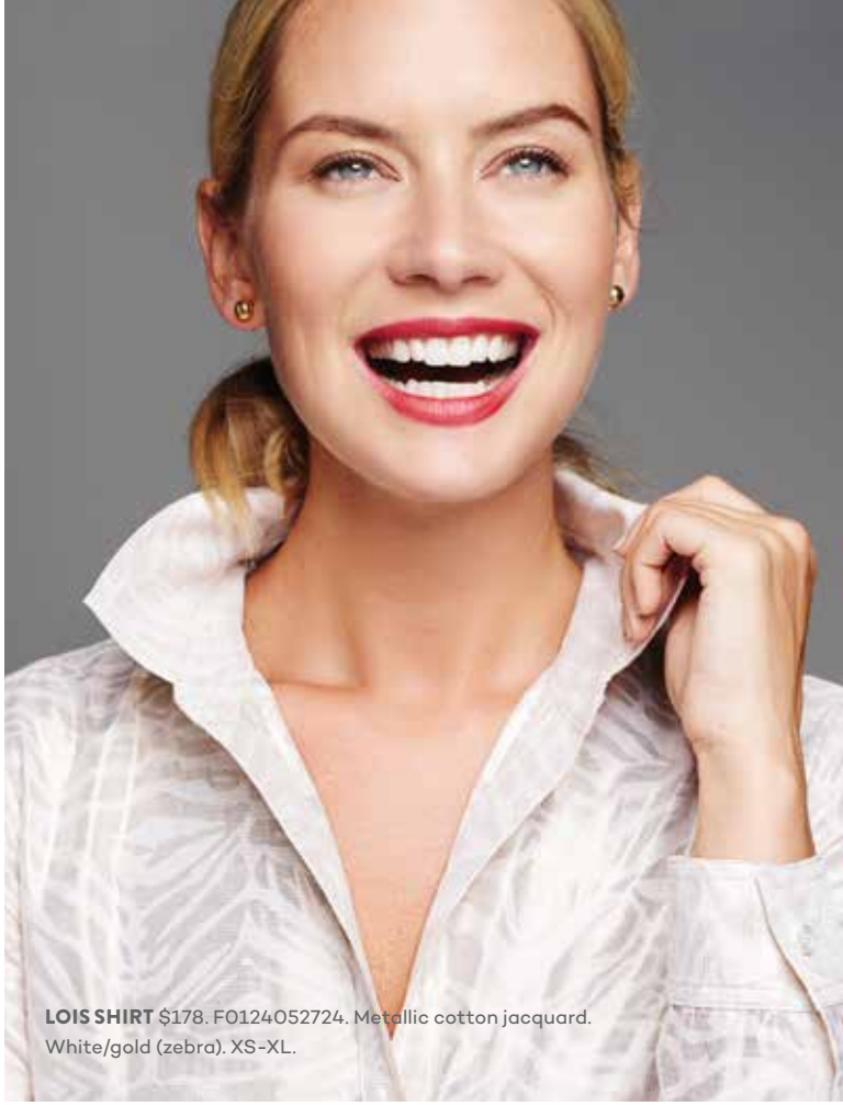
LOIS SHIRT $178. F0124052724. Metallic cotton jacquard. White/gold (zebra). XS-XL.