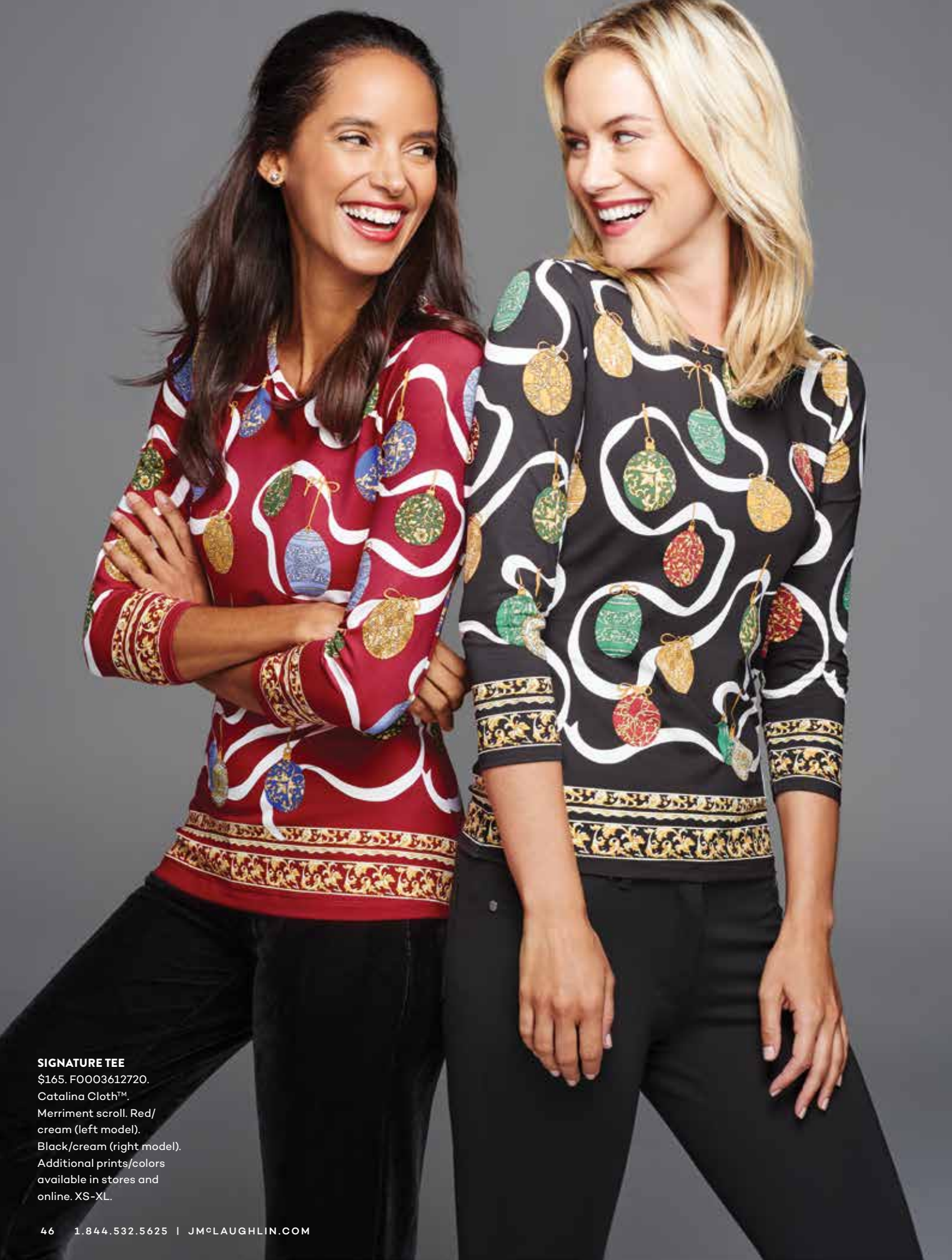
SIGNATURE TEE $165. F0003612720. Catalina Cloth™. Merriment scroll. Red/ cream (left model). Black/cream (right model). Additional prints/colors available in stores and online. XS-XL.