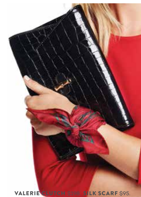
VALERIE CLUTCH $108. SILK SCARF $95.

You'll have everyone vying for a spot on your nice list.