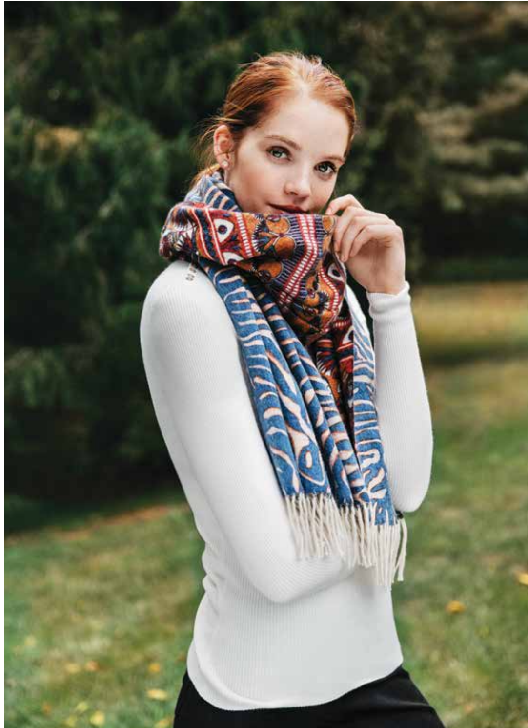
left page, JAIPUR SCARF $338. F0097312666. Cashmere. Reversible. Mustard/navy (amarna savannah). Additional prints/colors in stores and online. OS. BEACON SWEATER $145. F0114221022. Cotton modal. Egret white (solid). Additional colors in stores and online. XS-XL.