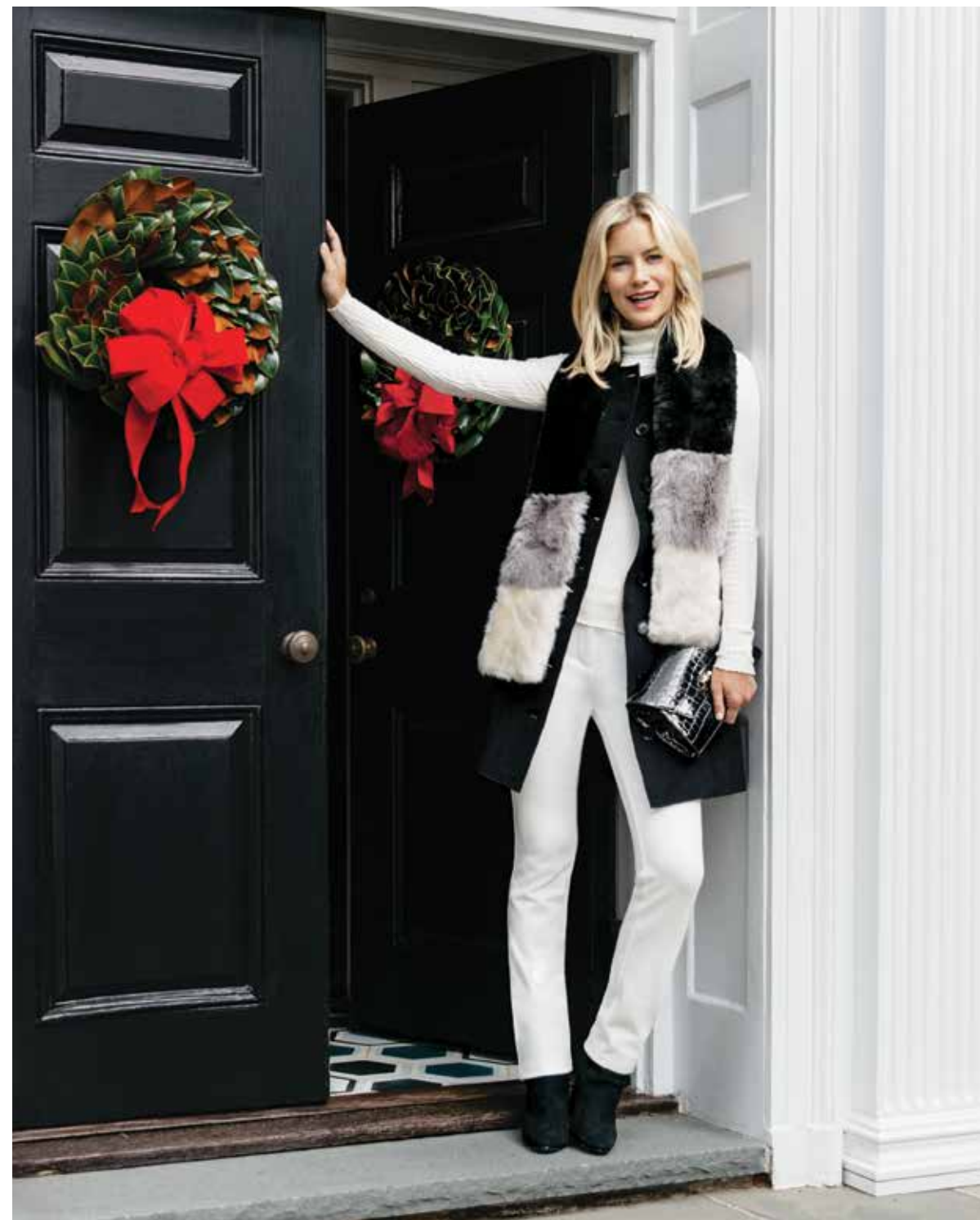
left page, CORTINA PONCHO $178. FO077912690. Rabbit fur with Acrylic knit. White/tan/cream (tricolor). Additional colors in store and online. OS. CLEMENCE SWEATER $178. FO119131022. Cotton modal. Egret white (solid). Additional colors in store and online. XS-XL. FELICITY PANT $175. FO125761022. Stretch twill corduroy. Eggplant (solid). Additional colors in store and online. 0-14. right page, ROLAND VEST/DRESS $288. FO129051022. Wool/cashmere with Vegan leather. Black (solid). XS-XL. NEVE SCARF $68. FO118272038. Faux fur. Black/gray/white (colorblock). OS. ARLETTE TURTLENECK $145. FO011451022. Cotton modal. Egret white (solid). Additional colors available in stores and online. XS-XL. LEXI JEAN $165. FO117501022. Knit denim. Egret white (solid). Additional colors available in stores and online. 0-14. VALERIE CLUTCH $198. FO118381022. Patent leather. Black (embossed crocodile). OS.