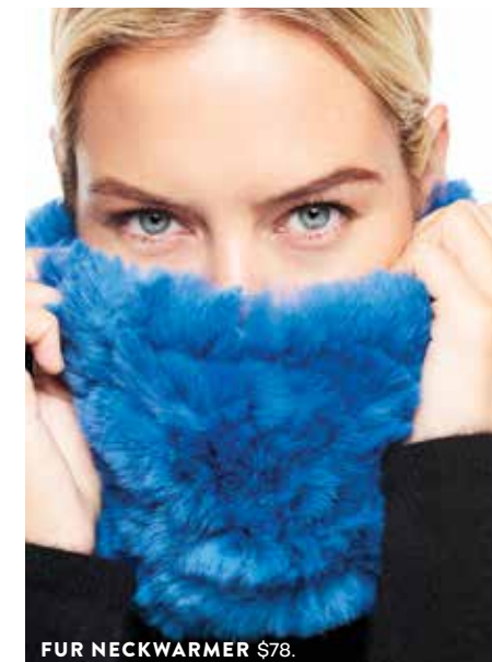
FUR NECKWARMER $78.