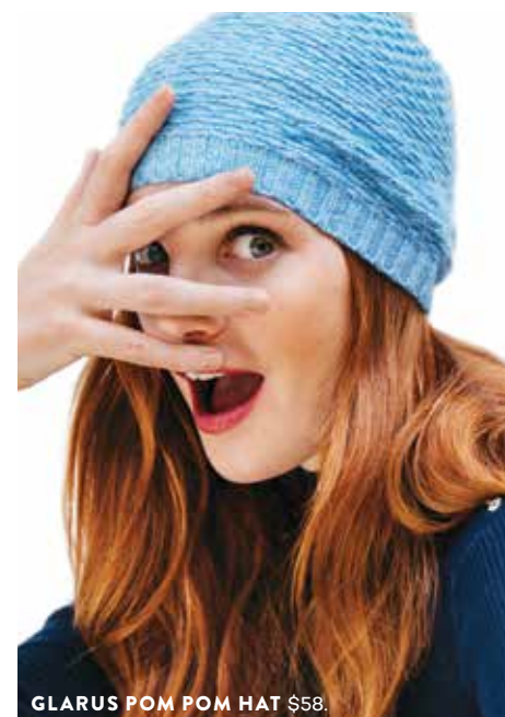
GLARUS POM POM HAT $58.