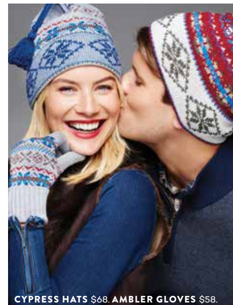
CYPRESS HATS $68. AMBLER GLOVES $58.