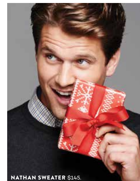
NATHAN SWEATER $145.