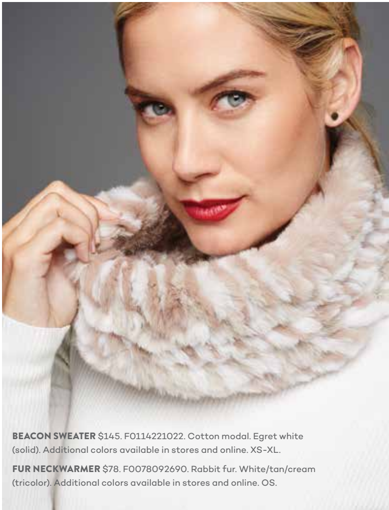
BEACON SWEATER $145. F0114221022. Cotton modal. Egret white (solid). Additional colors available in stores and online. XS-XL. FUR NECKWARMER $78. F0078092690. Rabbit fur. White/tan/cream (tricolor). Additional colors available in stores and online. OS.