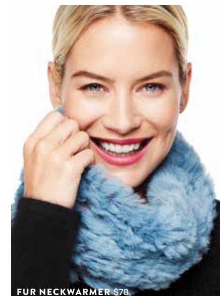
FUR NECKWARMER $78.